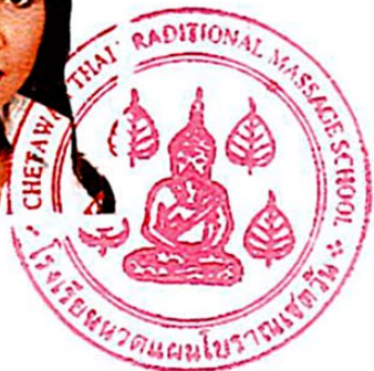
Principle of The School